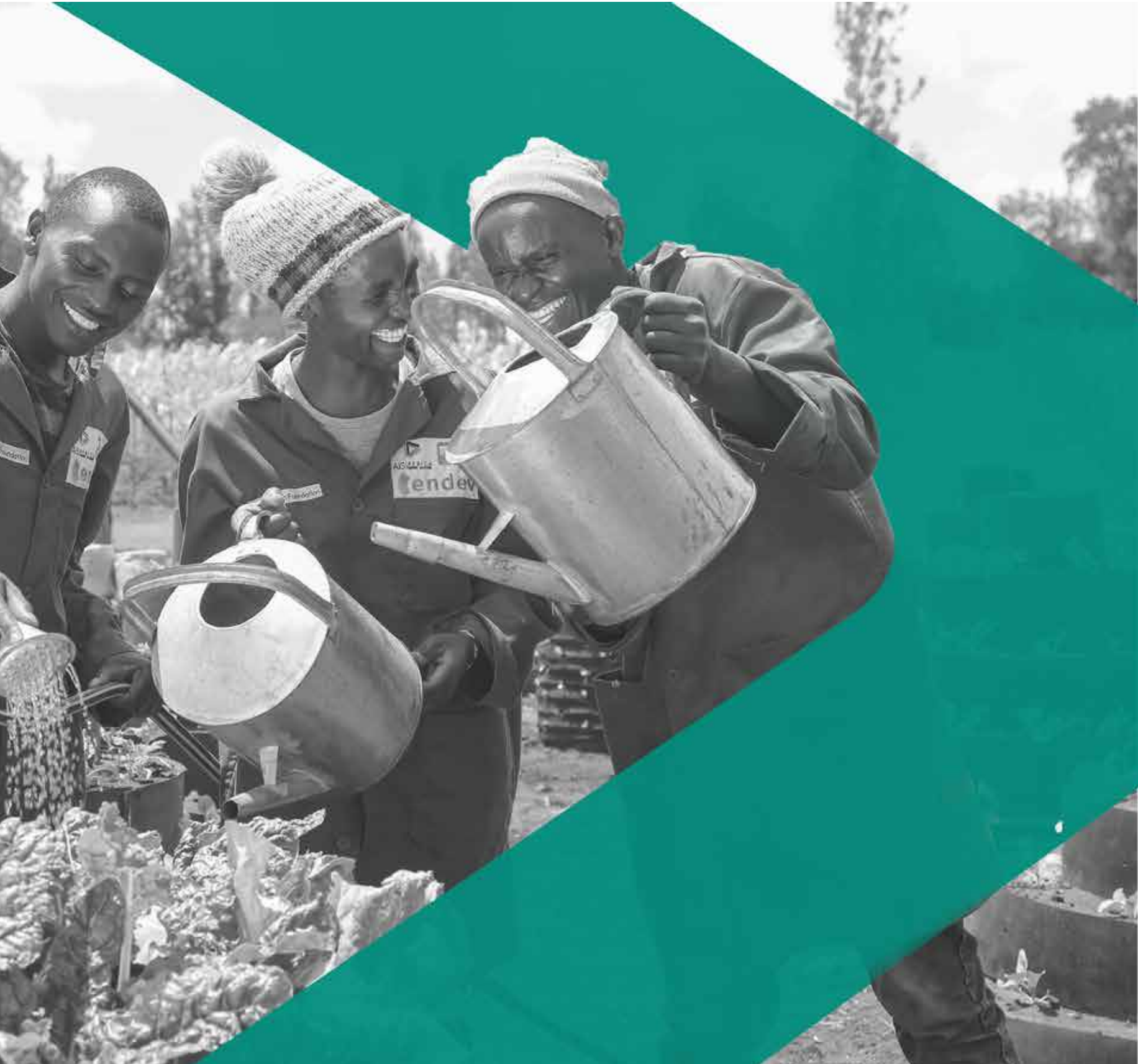
TABLE OF CONTENT